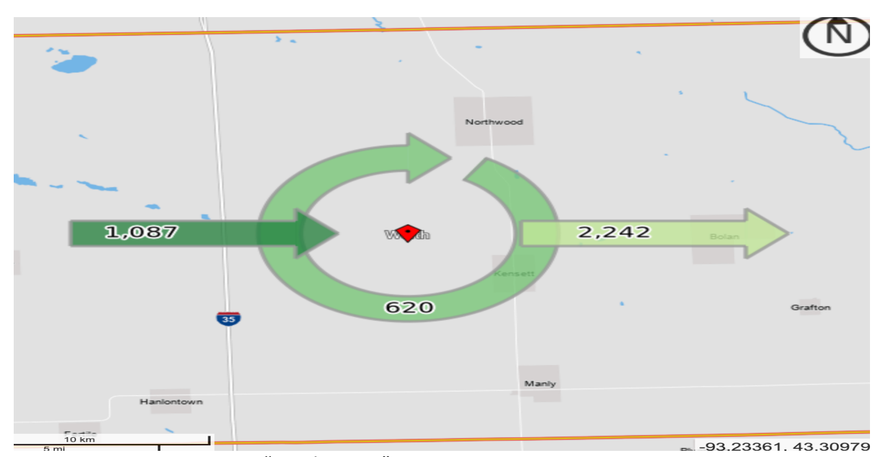
Figure 1: Worth County Workforce Commuting Pattern